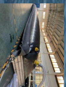
25 tons Neoprene Rubber floating tank