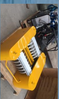
Disc, Drum, Brush skimmers