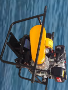
Portable diaphragm pumps