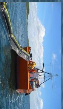
Neoprene Rubber Booms