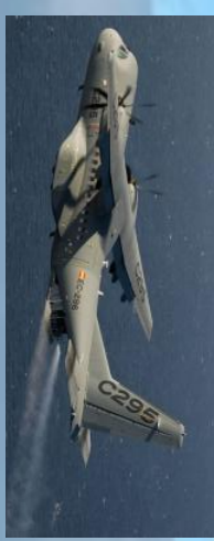
Ayles Ferrie oil dispersant spraying systems